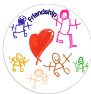
Isabella - Reception